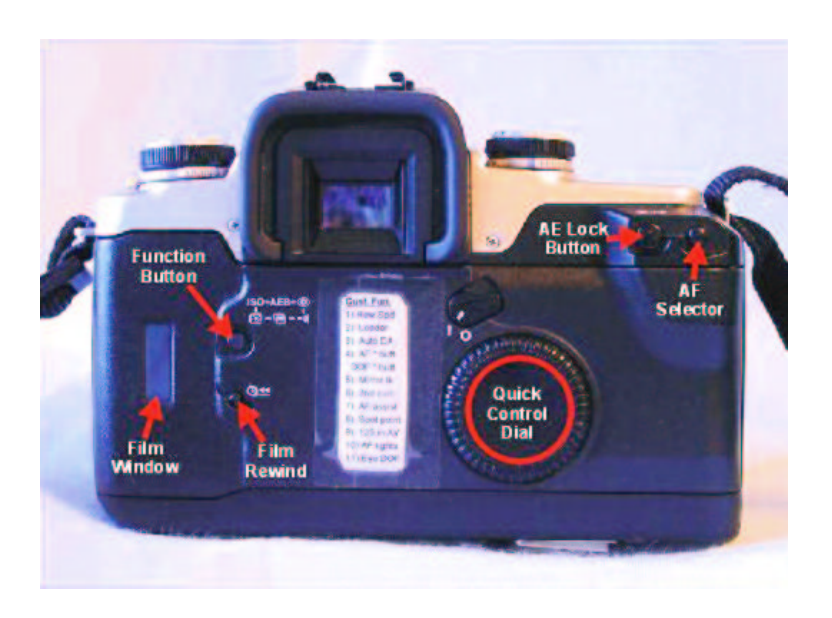
Figure 4: Back View

they only work with the latest Nikon Camera bodies, but the competition on this front is heating up. Also Sigma has some similar HSM lenses that are made in both Canon and Nikon mounts.