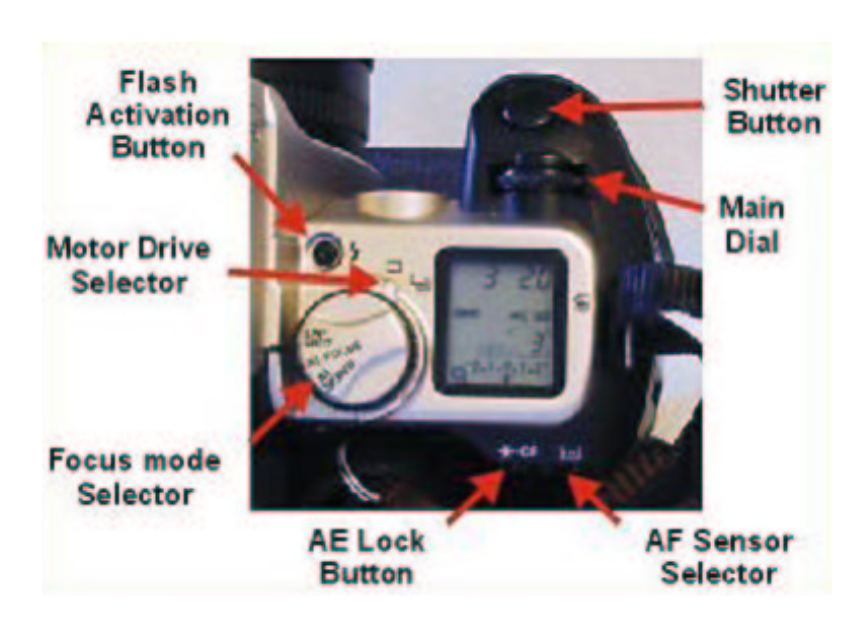
Figure 1: Top View