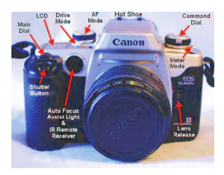
Figure 6: Front View

units do not cover the side AF points however, so with those flashes, the camera will use it's own AF assist light when a side AF point is selected. When using some large diameter lenses the left side AF assist light may be blocked by the lens barrel. The dark red circle that houses the AF assist light, close to the shutter button, also houses the receiver for the optional IR remote control, RC-1.