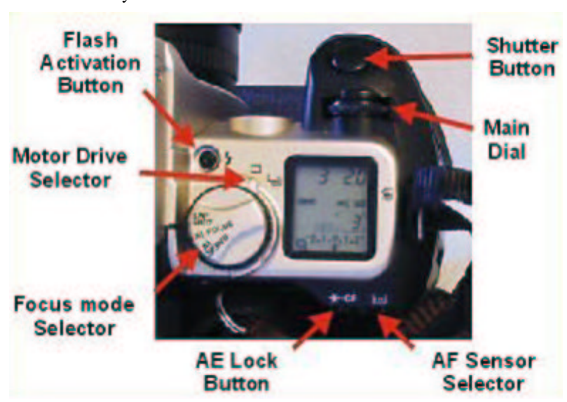
Figure 3: Focus Mode Switch

On the other side of the prism/flash hump you'll find the Focus mode switch and the Film Advance switch. The Focus mode switch is on top and has three positions and of course, only works when the lens is set to AF mode itself. In One Shot mode, as soon as you press the shutter button half way down, the camera will autofocus and lock onto on a subject and it stays locked at this distance as long as you continue hold the shutter button half way down. In this mode the focus has to lock onto some distance before the shutter will fire. This can prevent out of focus pictures as long as the subject doesn't move towards or away from the camera.