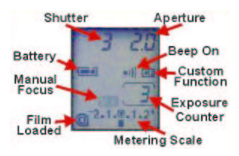
Figure 7: LCD Panel

The liquid crystal display (LCD) on the top right side of the camera, shows quite a bit of information about what is going on with the camera. At the top left is a numeric display that shows the shutter speed when metering, but is also used to show the film speed, custom function number and eye calibration number. At the top right is the aperture display that is also used to show AEB amount, and custom function option, red eye, and beeper setting numbers. The next row down has the ECF on indicator, ISO, AEB and red eye reduction on symbols.